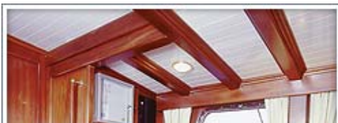
Clarissa´s "mini-office" with charts

Please see complete Technical Specifications click here