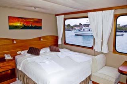
1 of 7 King/Twin Convertible Cabins