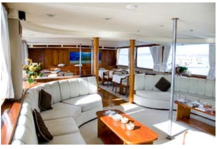
Main Salon - view looking starboard