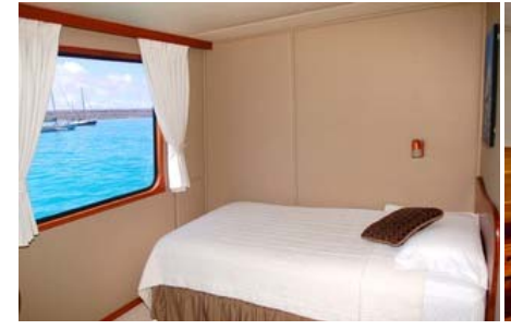
1 Single Cabin with Twin Bed