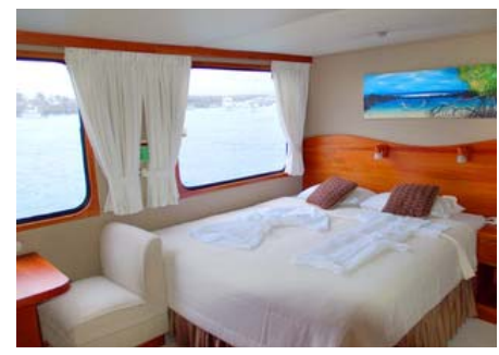
1 of 7 King orTwin convertible cabins