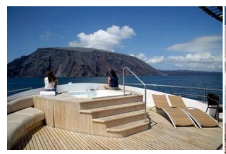
Sun Deck with Jacuzzi