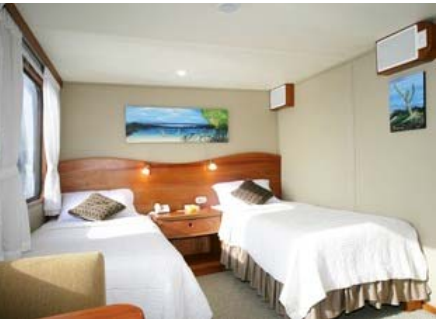
1 of 7 Twin/King Convertible Cabins