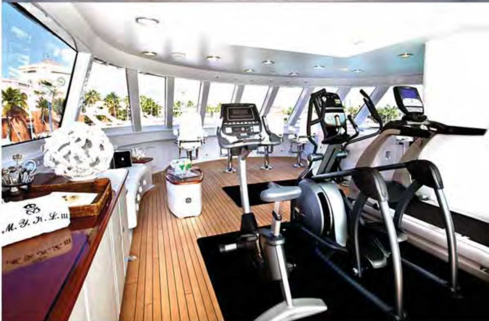
The Keri Lee Gym