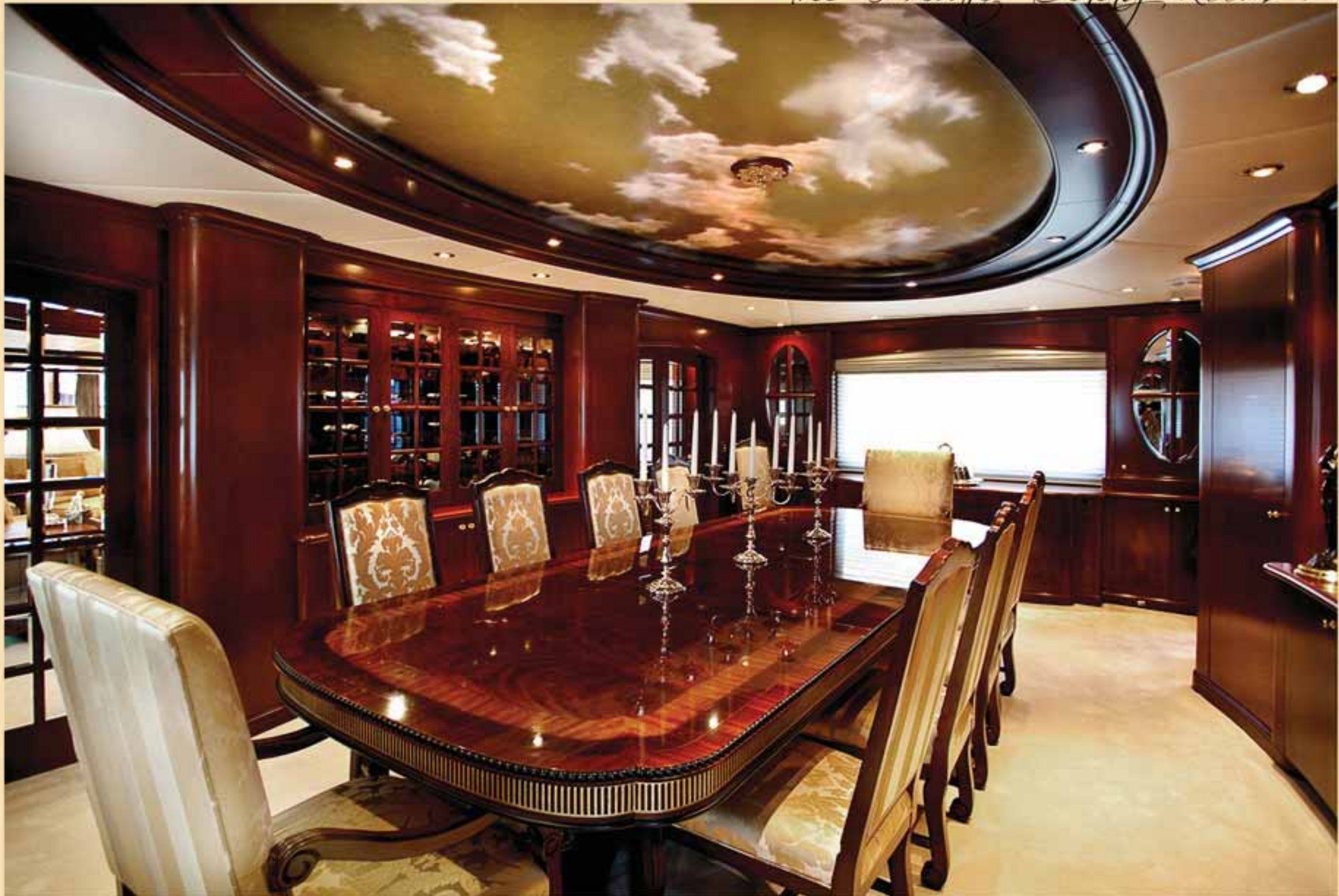
The Private Dining Room with its regal elegance, will make every formal Dinner Party a memorable experience.