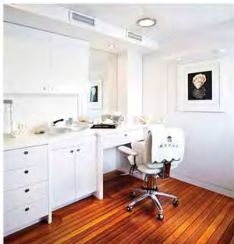
The Keri Lee Salon