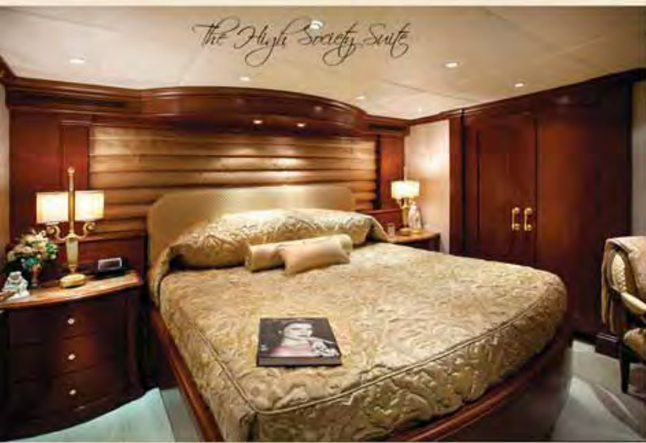
The High Society Suite