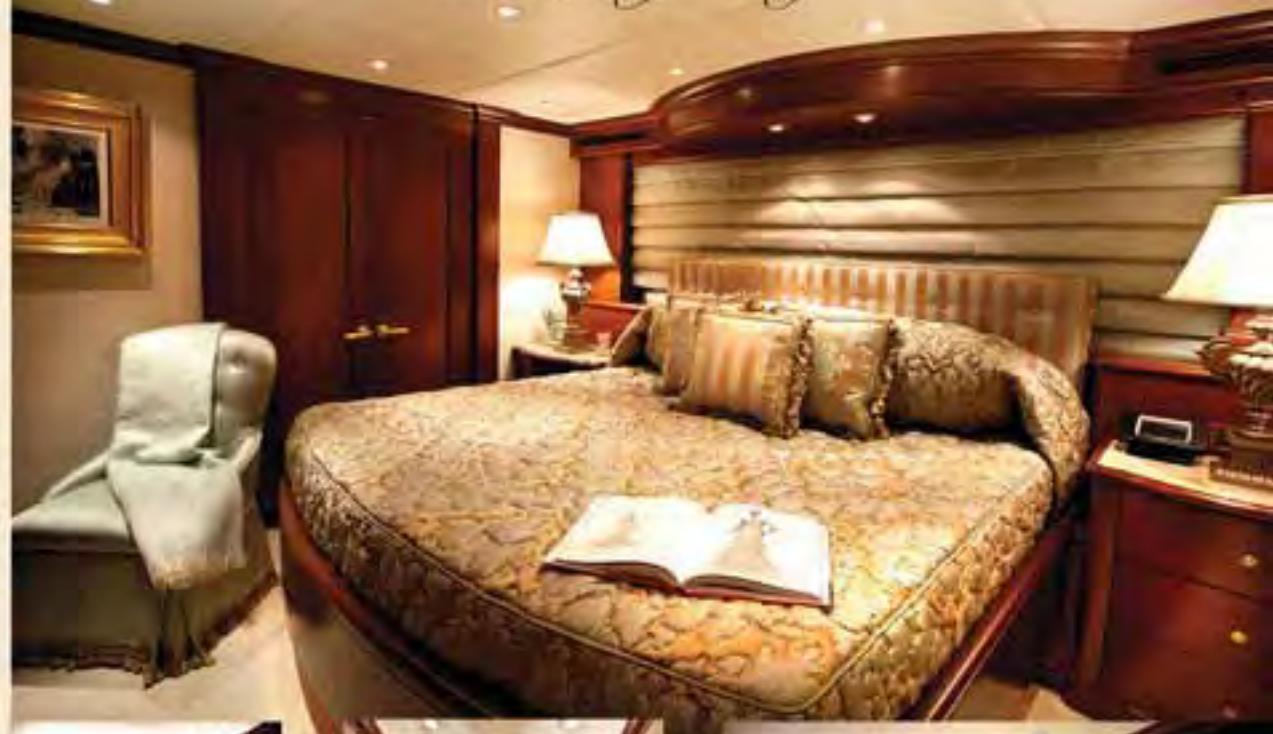
The Valentino Suite

Keri Lee III accommodates twelve guests to have their own privacy in six magnificent staterooms with private ensuites.