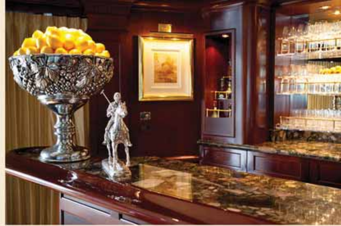
The Ralph Lauren Cocktail Bar