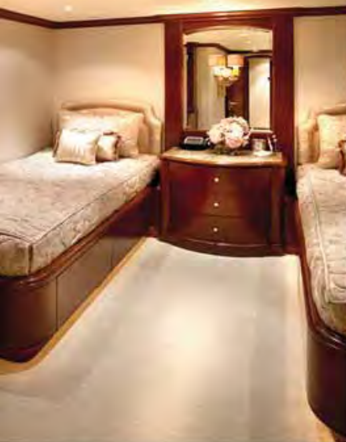
The Captains Suite