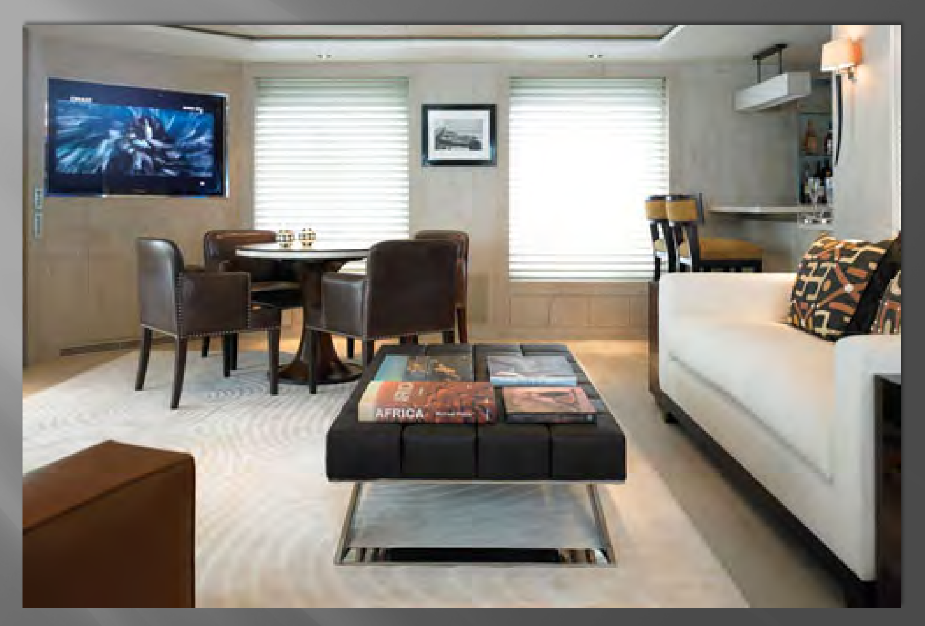
Skylounge 2 Upper deck