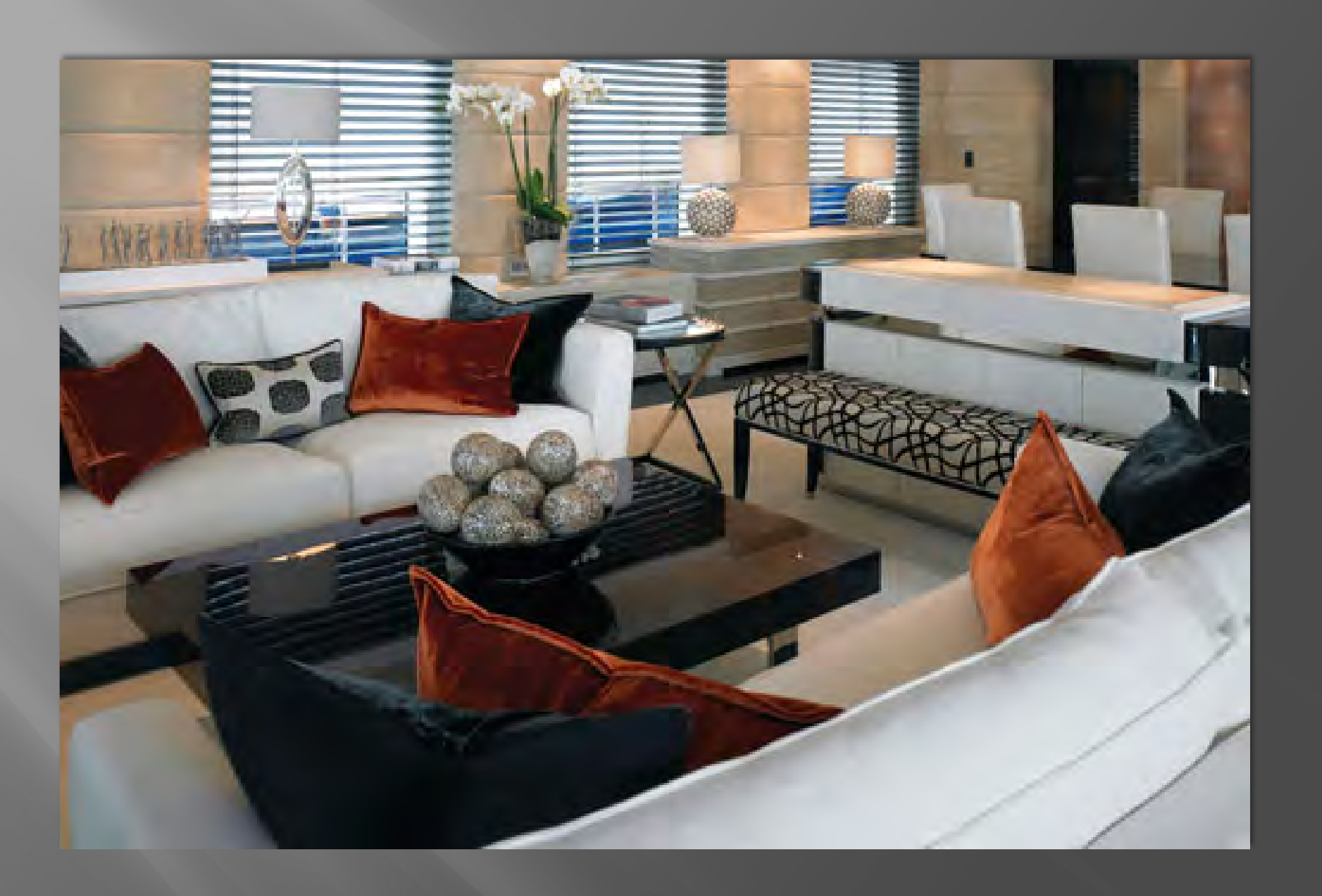
Saloon Main deck 2