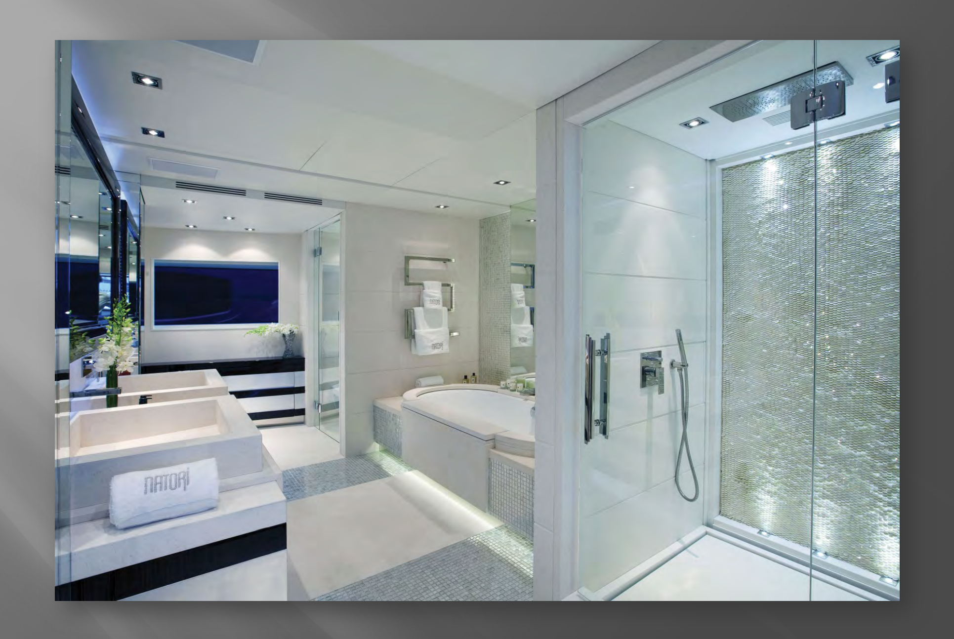
Bath Master suite