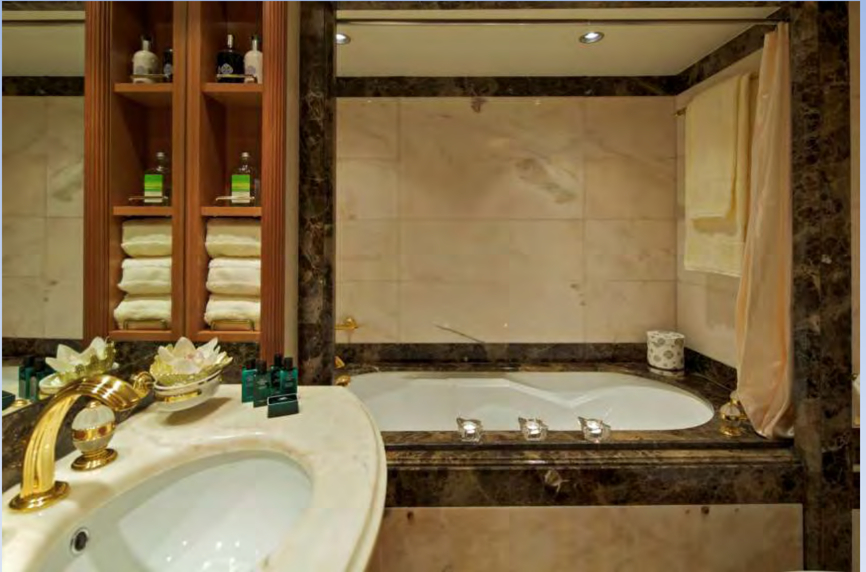
Guest Suite Bathroom