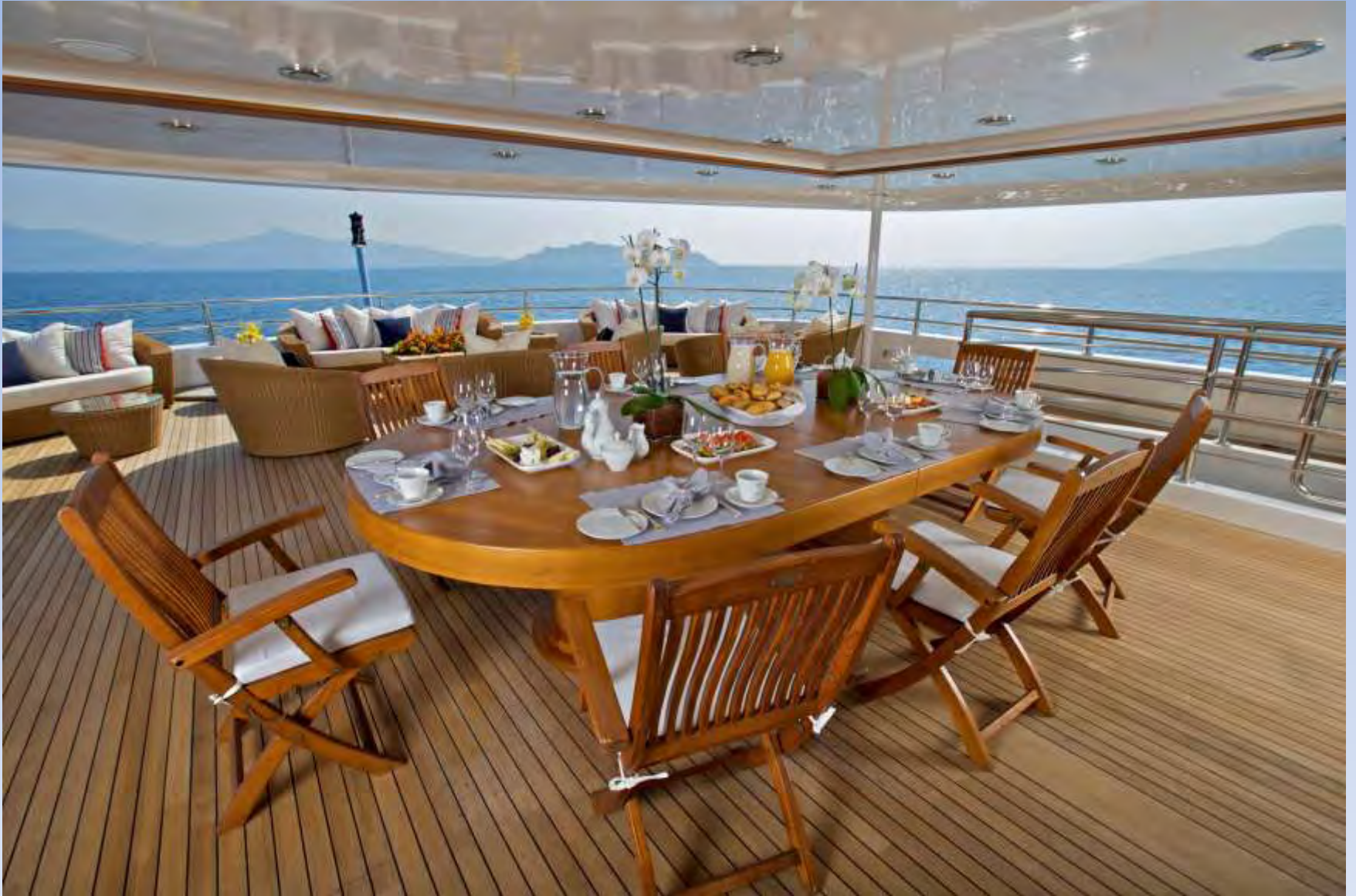
Upper Deck - Dining