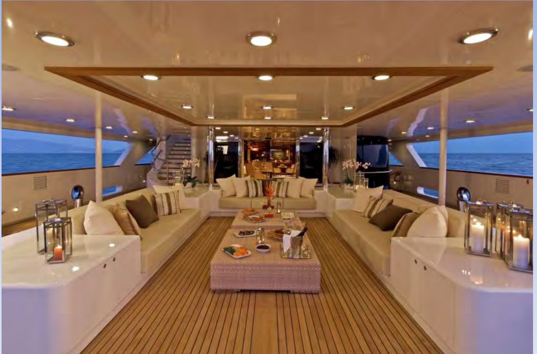
Main Deck - Lounge