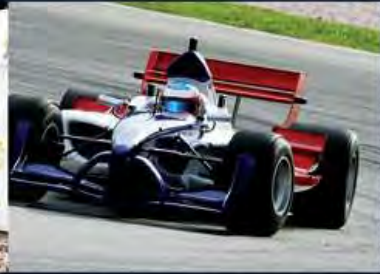
A Grand Prix de Monaco ▶