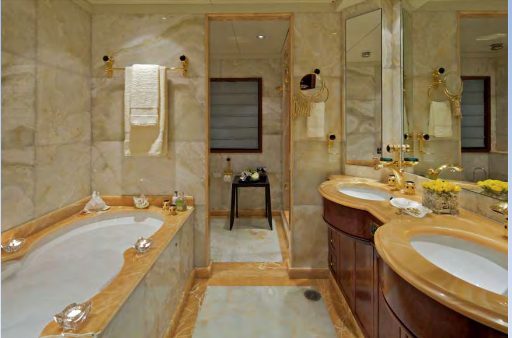
Master Suite Bathroom