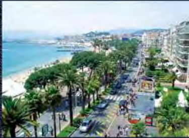
A Cannes Film Festival