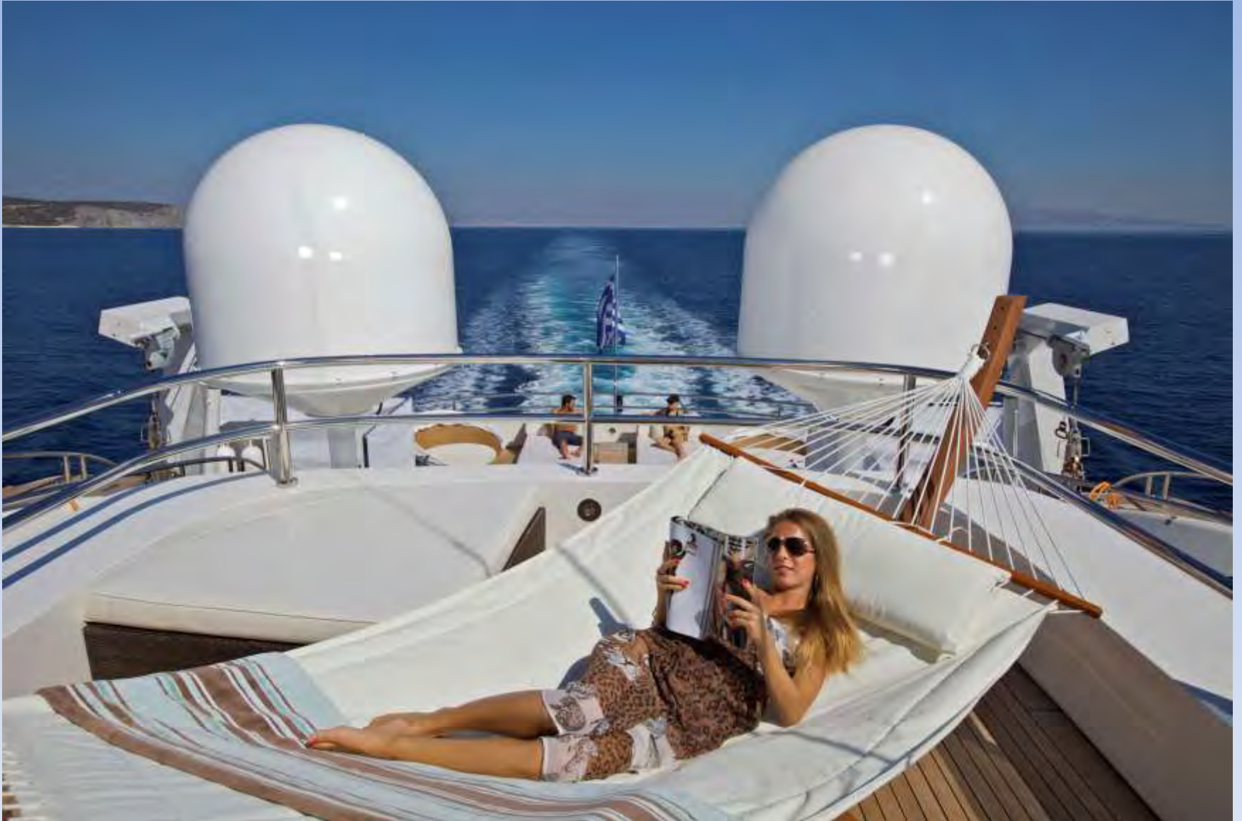
Sun Deck - Hammock