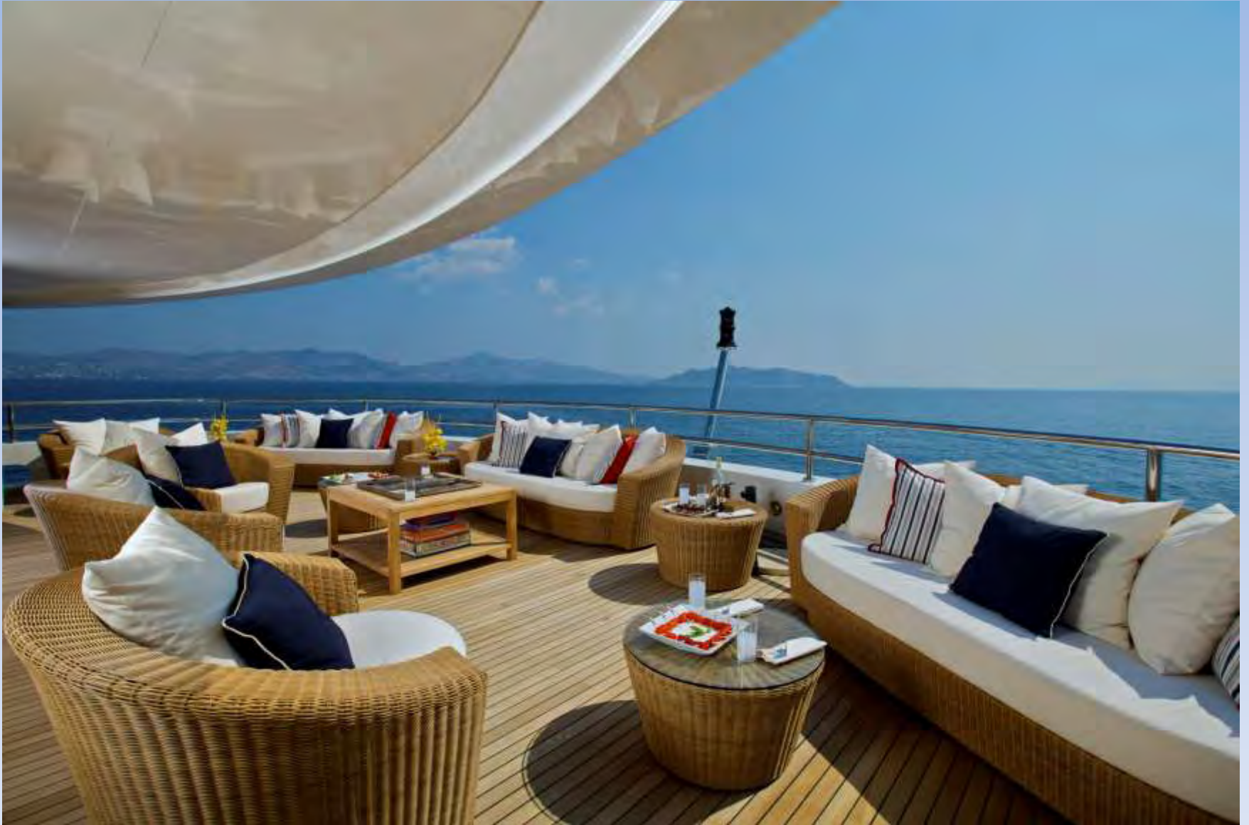
Upper Deck - Lounge