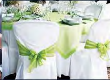
A Birthday & wedding parties