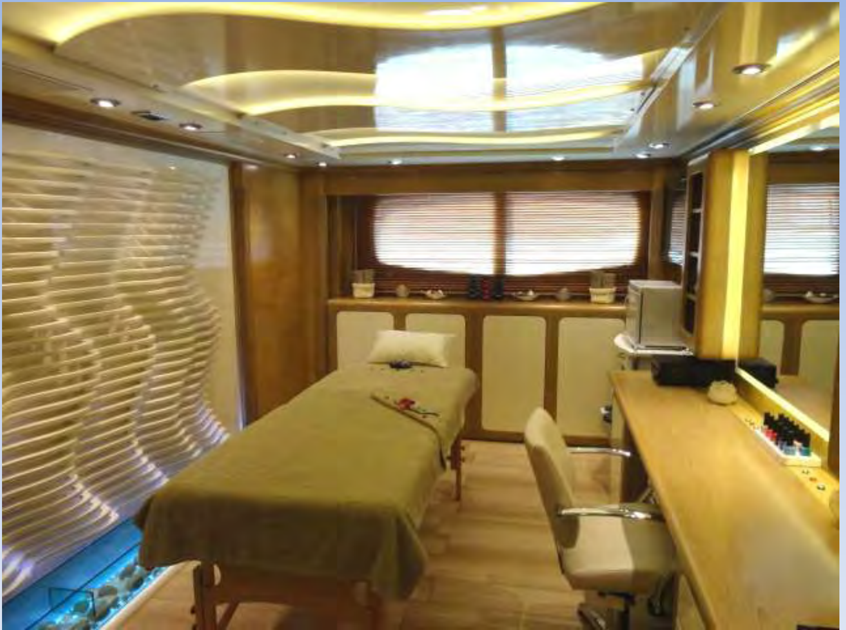
Massage Room / Beauty Salon