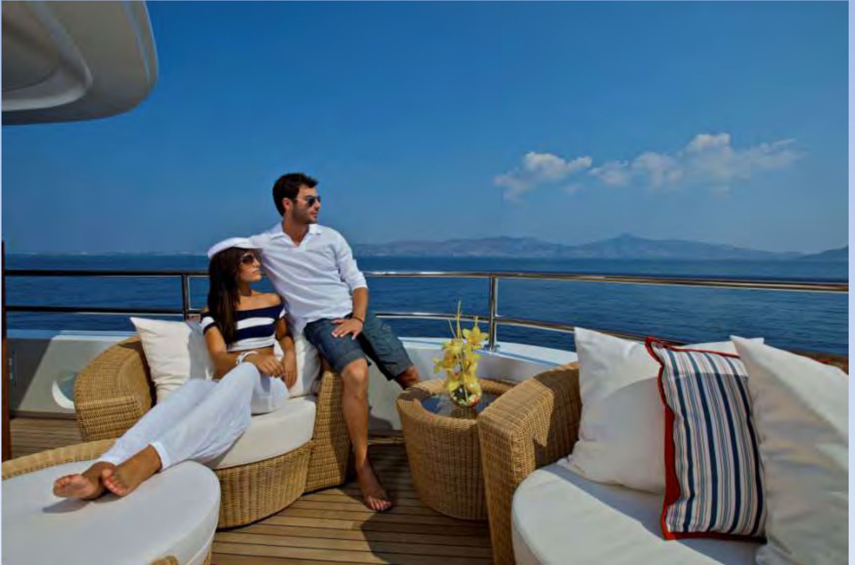
Upper Deck - Lounge