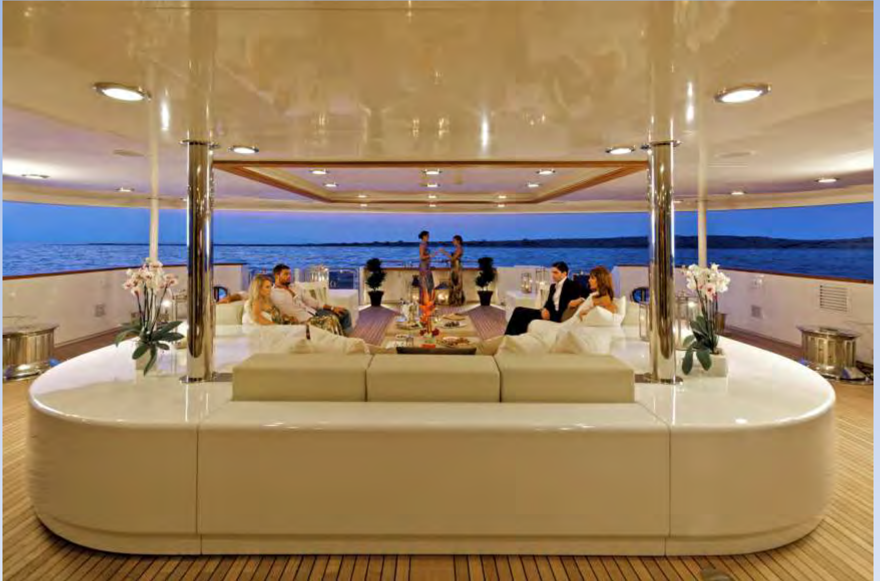
Main Deck - Lounge