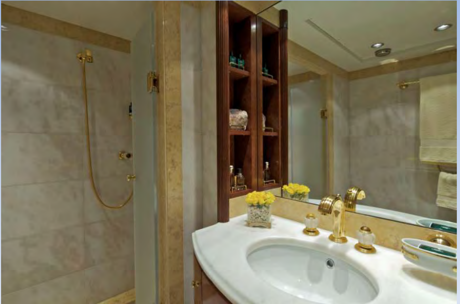
VIP Suite Bathroom