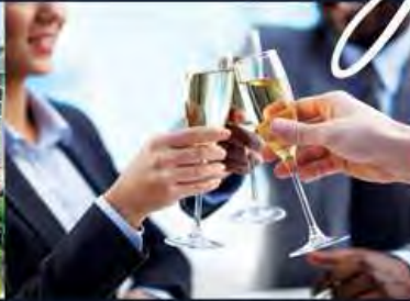
A Corporate events