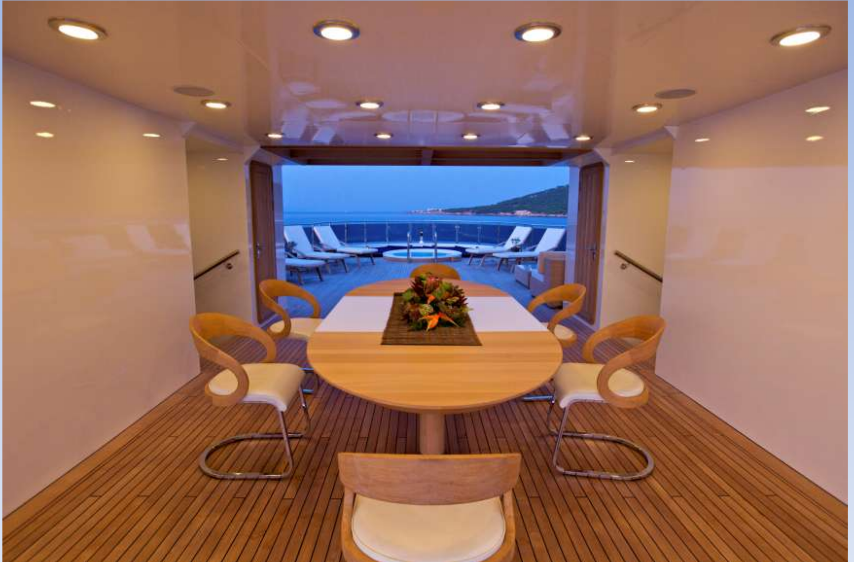
Sun Deck - Dinning