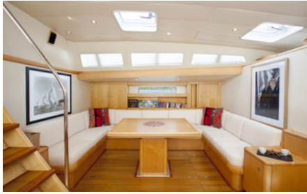
Salon Port Sette