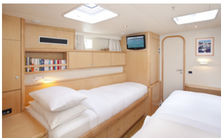
Forward Port Stateroom as Two Ins