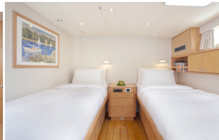
Amidship Port Stateroom as Two Ins