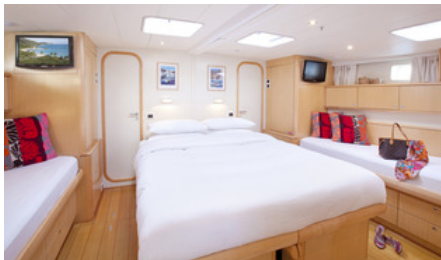
Forward Stateroom as Master King