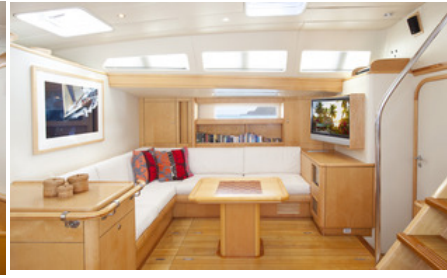
Salon Starboard Sette