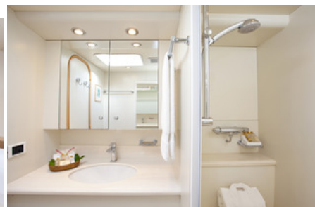
4 Stateroom baths have stall showers