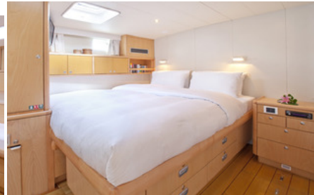
Amidship Starboard King Stateroom