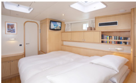
Forward Starboard Stateroom as King