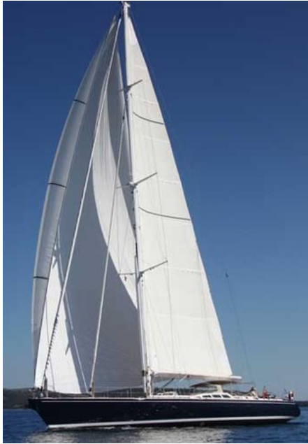
Full Sail Port Tack