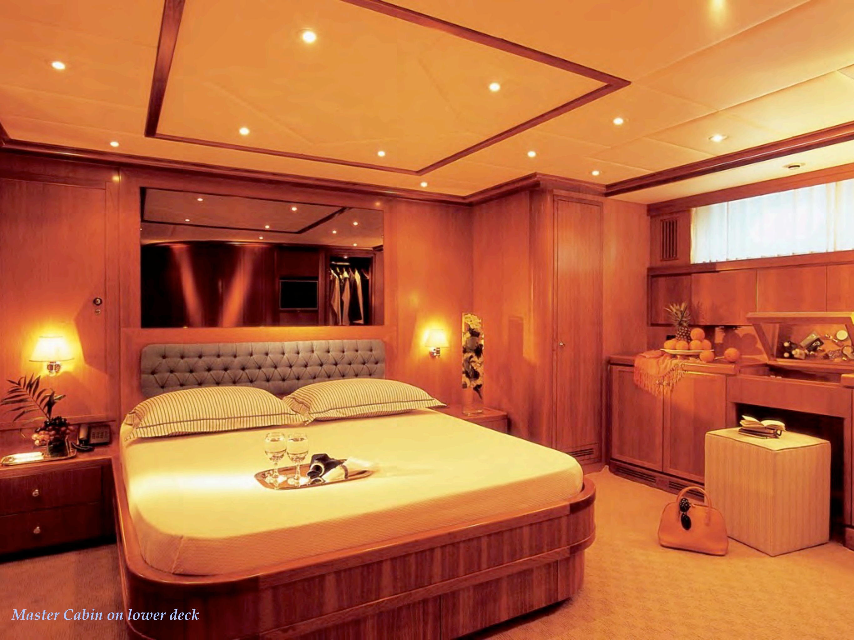
Master Cabin on lower deck