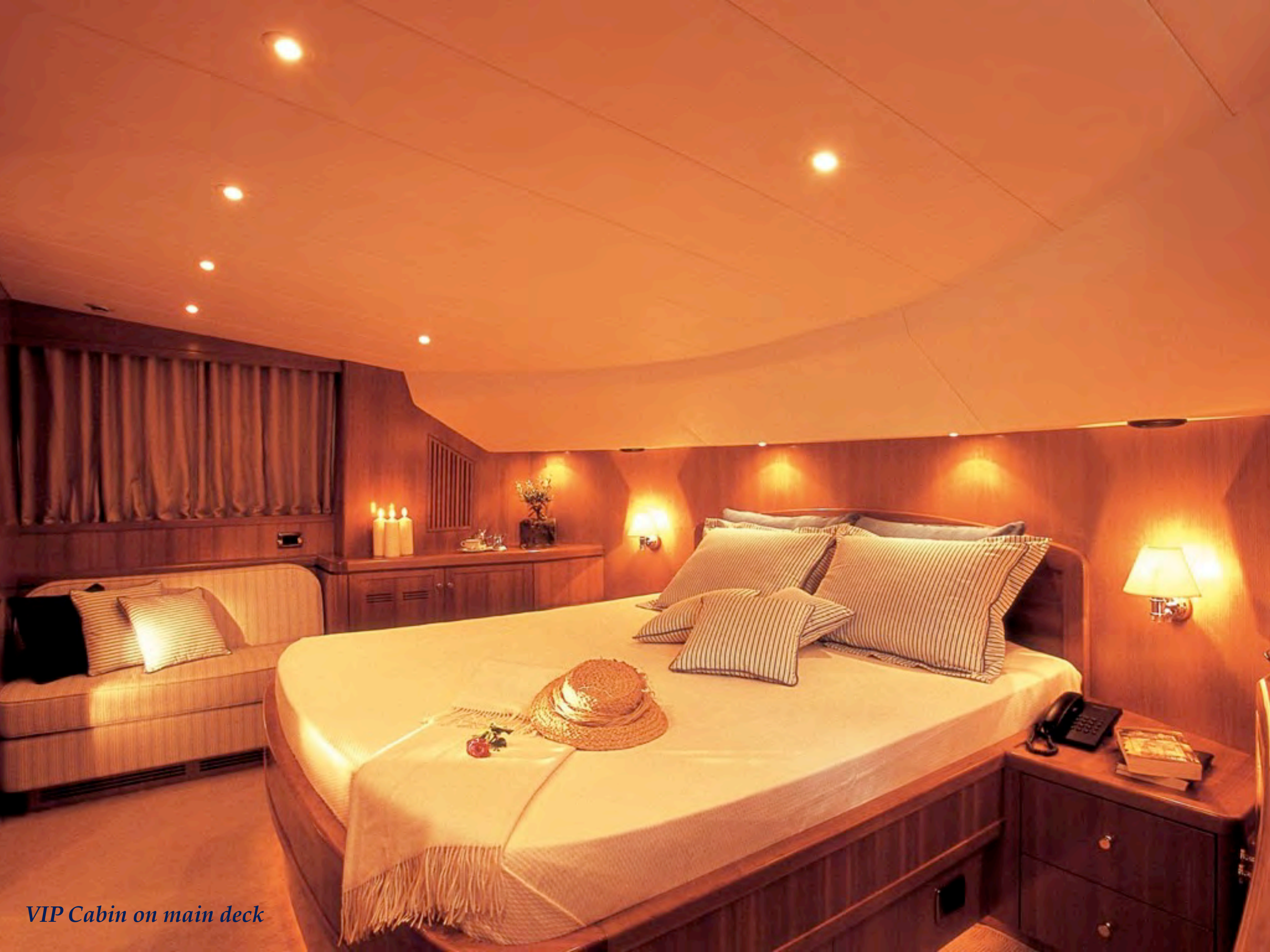
VIP Cabin on main deck