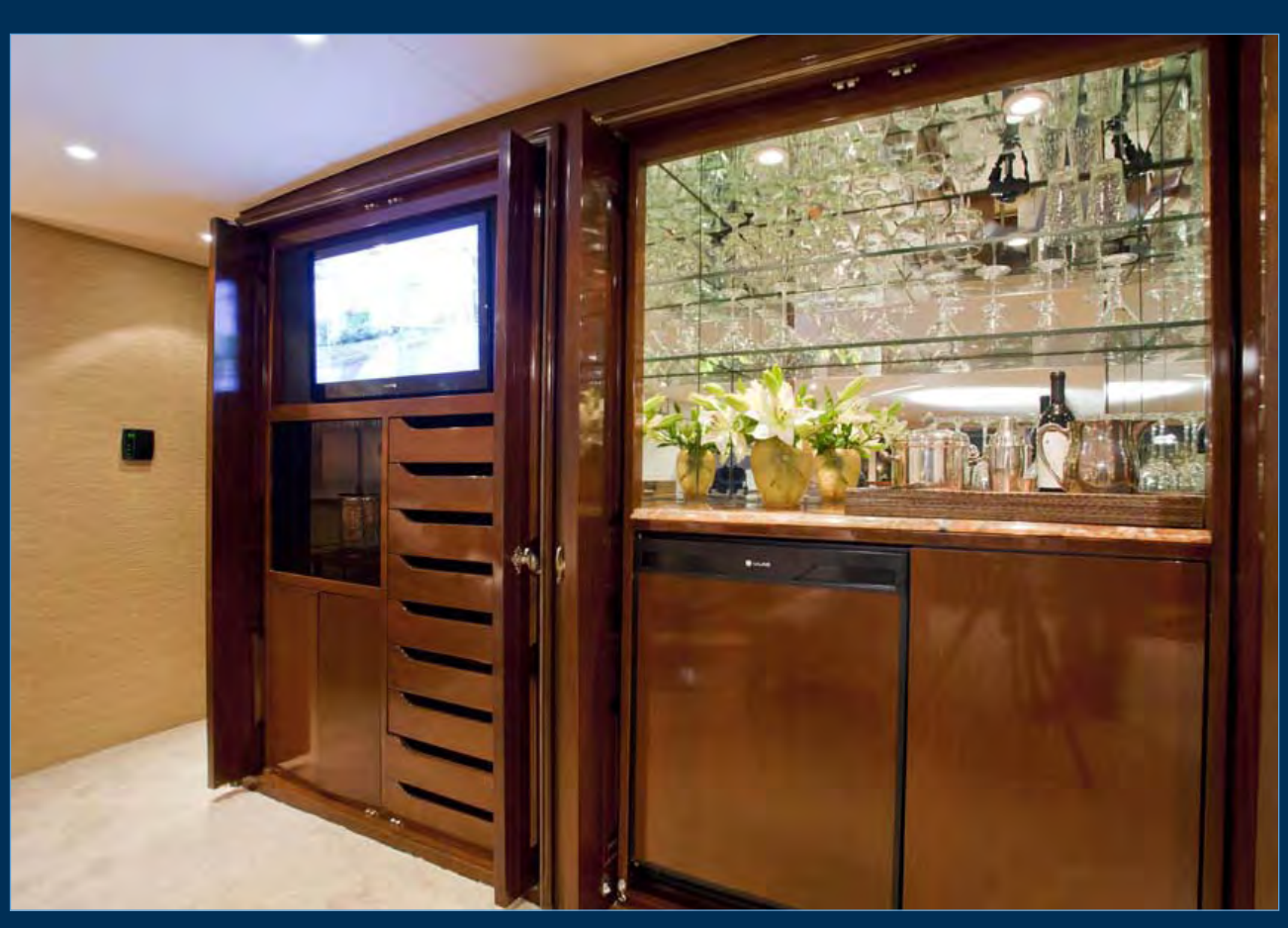
Main Salon Bar