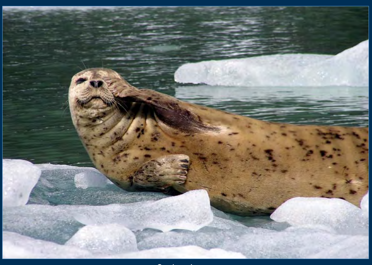
Seal on Ice