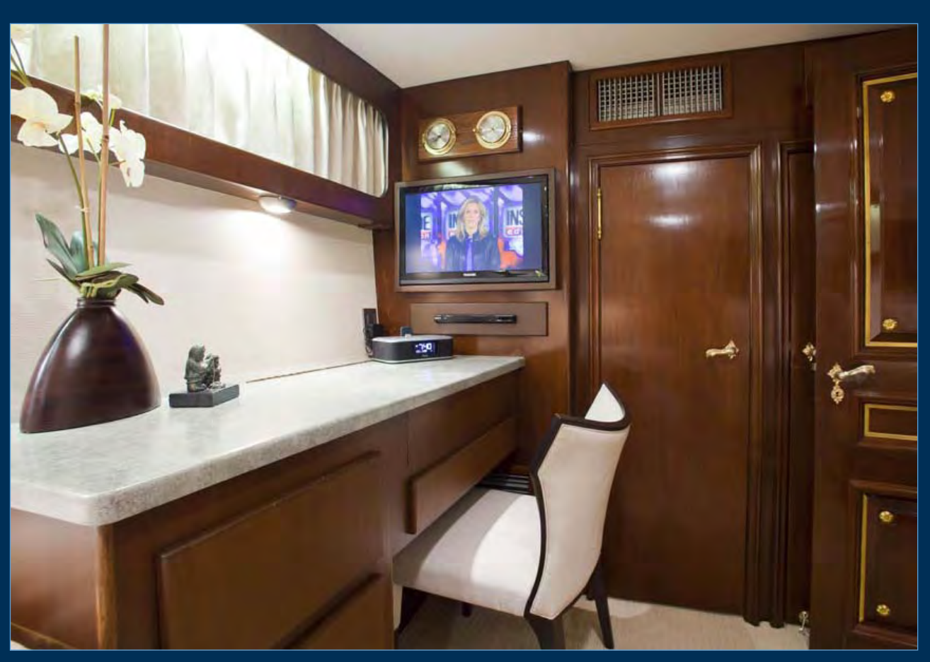
Starboard Twin Cabin