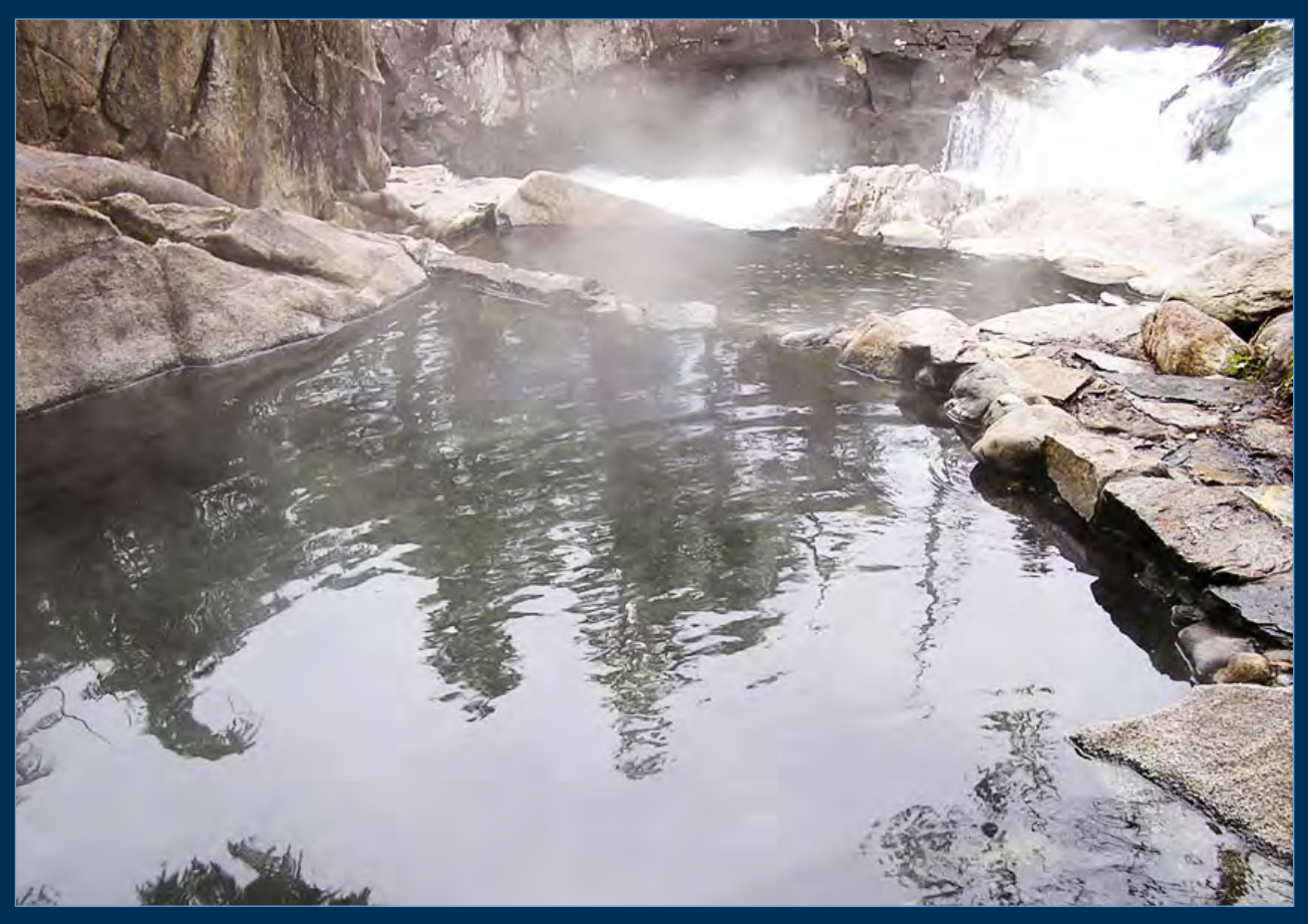
Baranof Warm Springs - a natural "hot tub" facing a roaring river