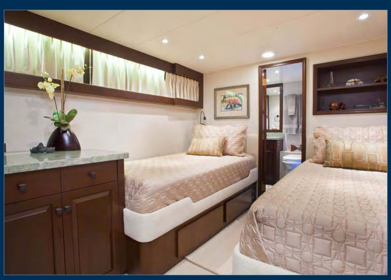
Port Twin Cabin