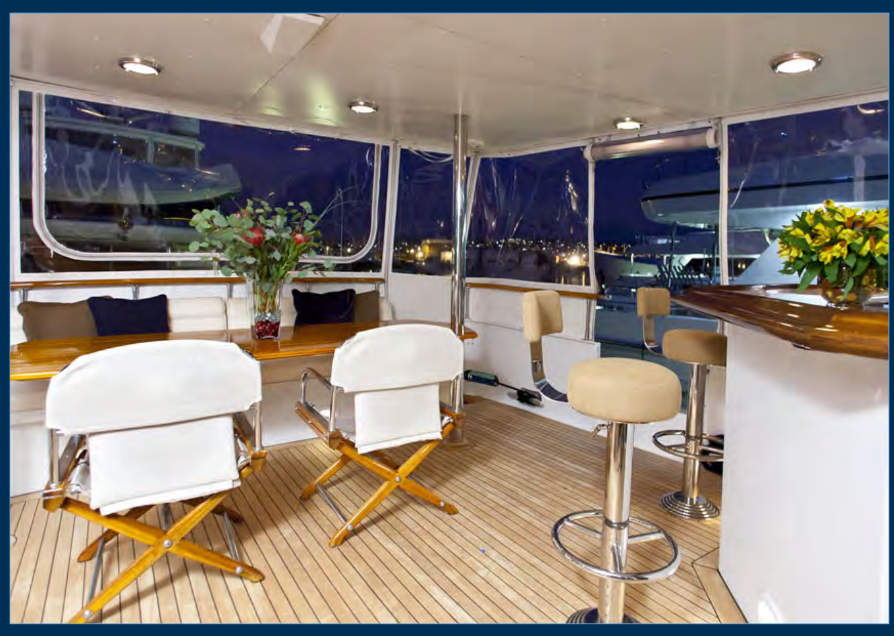
Enclosed Aft Deck