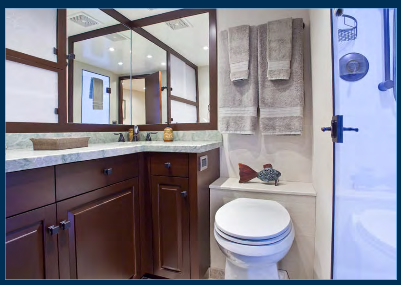
Port Twin Bathroom