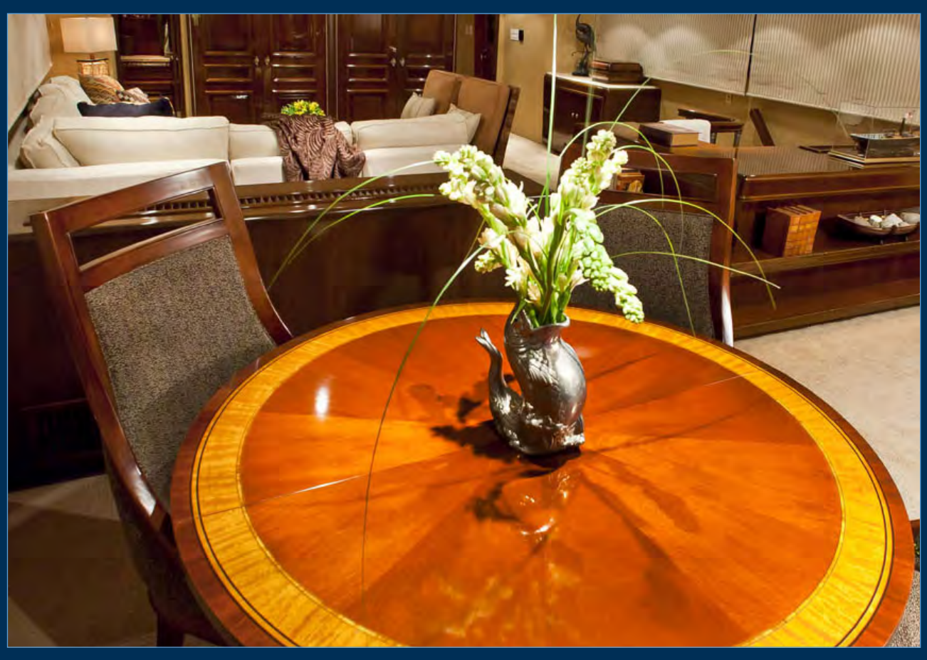
Main Salon Game Table