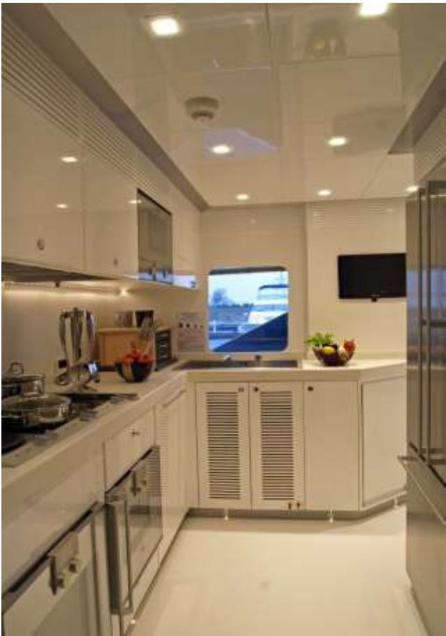
Main Deck Lobby and Galley .