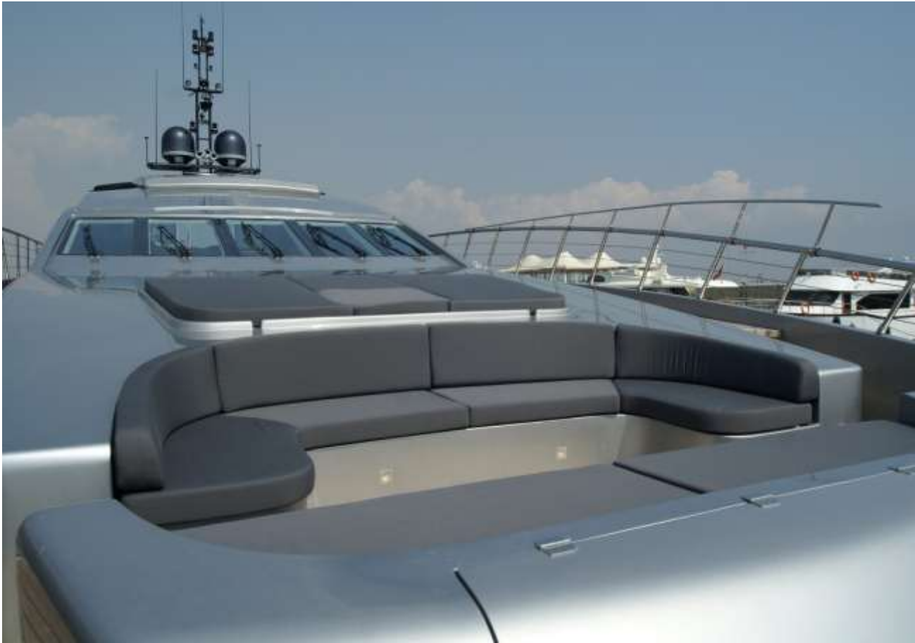
Main Deck Forward seating area.