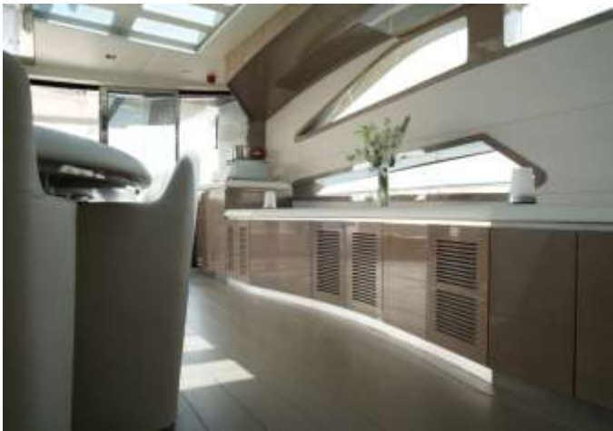
Upper Deck Spacious Dining Salon Seating 8 guests under skylight ceiling.