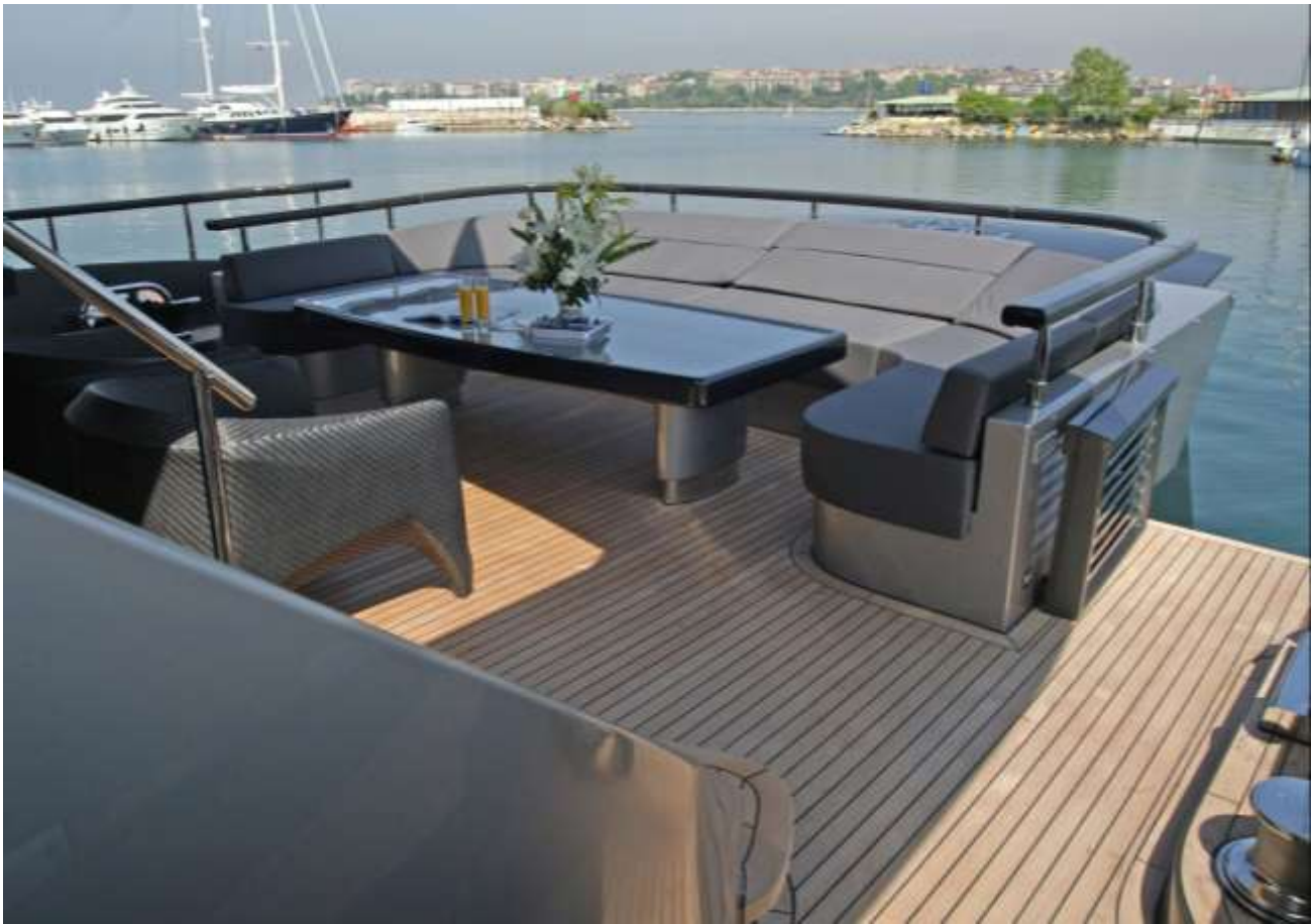
Main Deck Aft seating area.