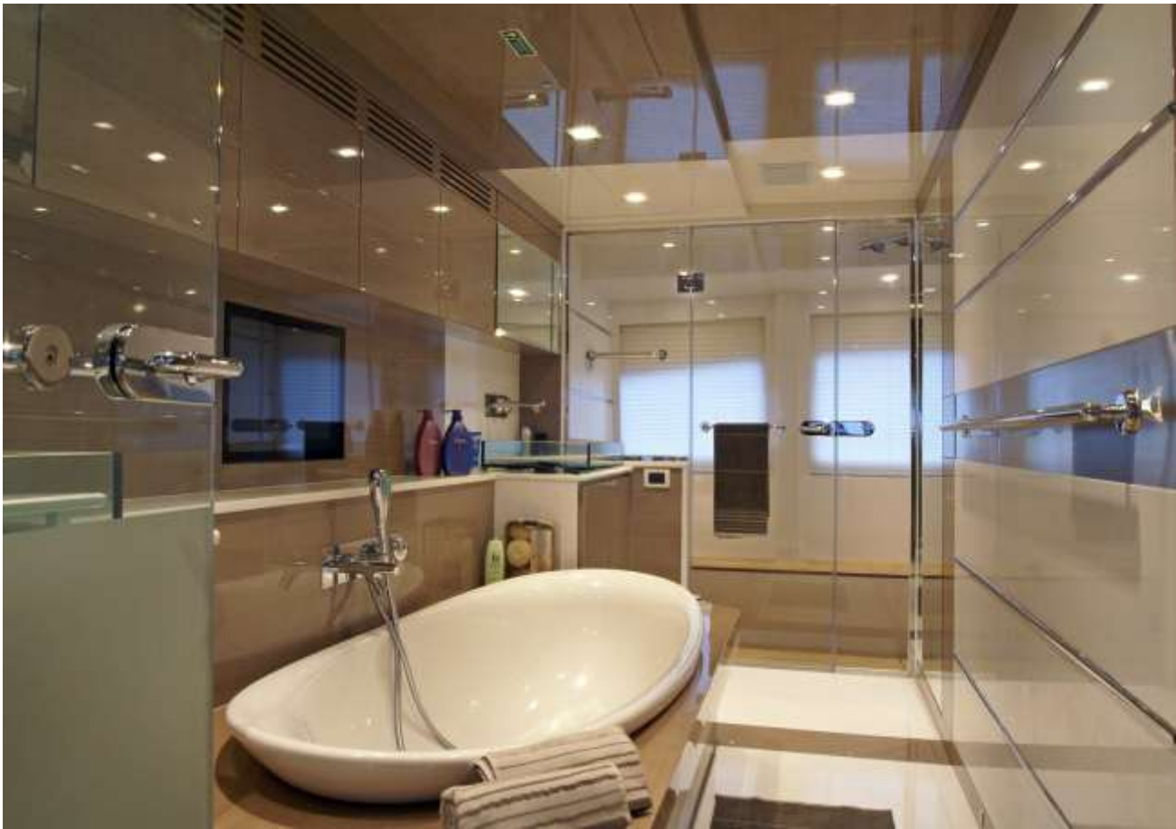
Main Deck Master Bath Large soaking tub and separate shower.