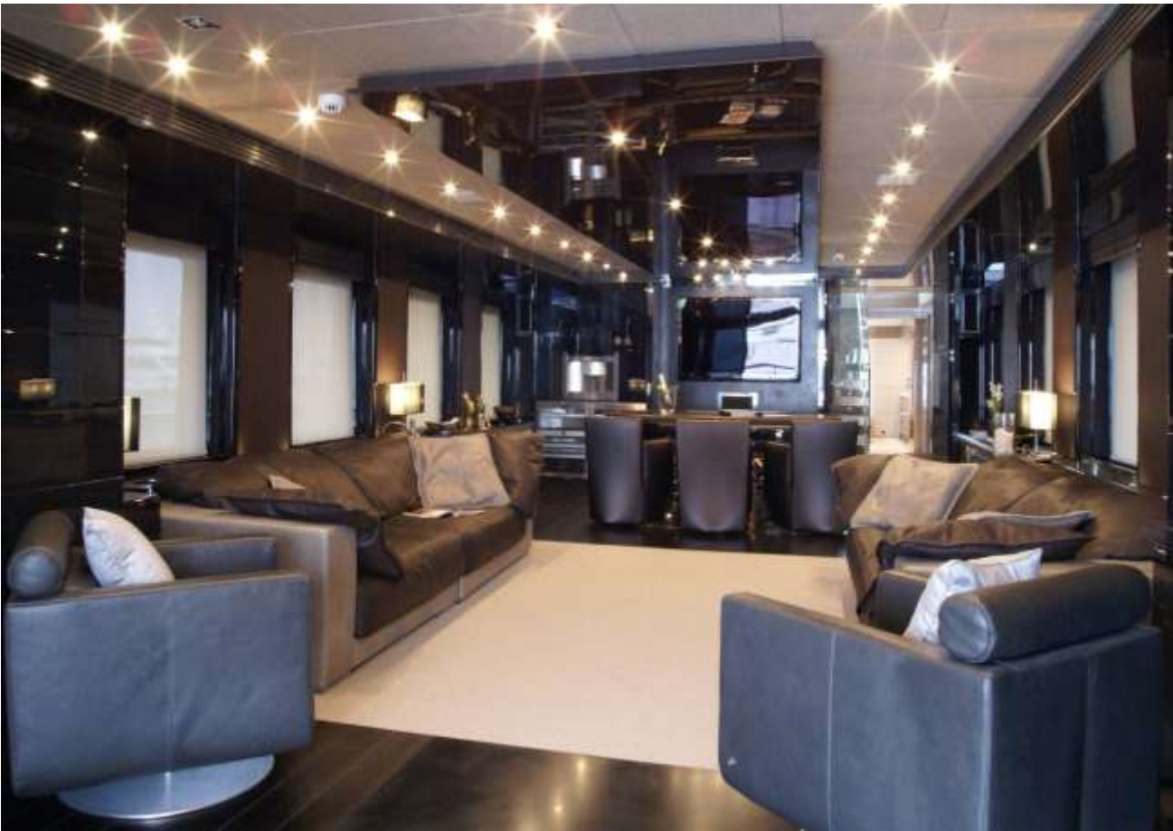
Main Deck Main Salon Large screen TV, bar area surrounded by contemporary seating.