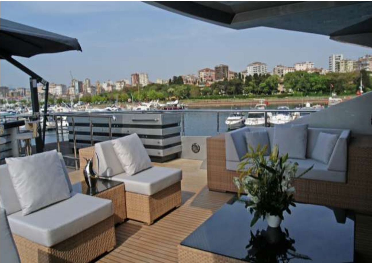
Upper Aft Deck Spacious seating area just aft of dining salon.