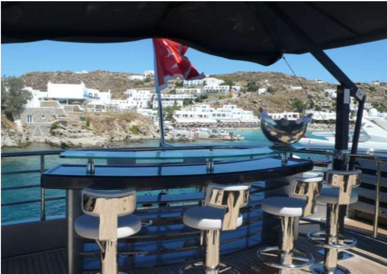
Upper Aft Deck Aft facing bar area.