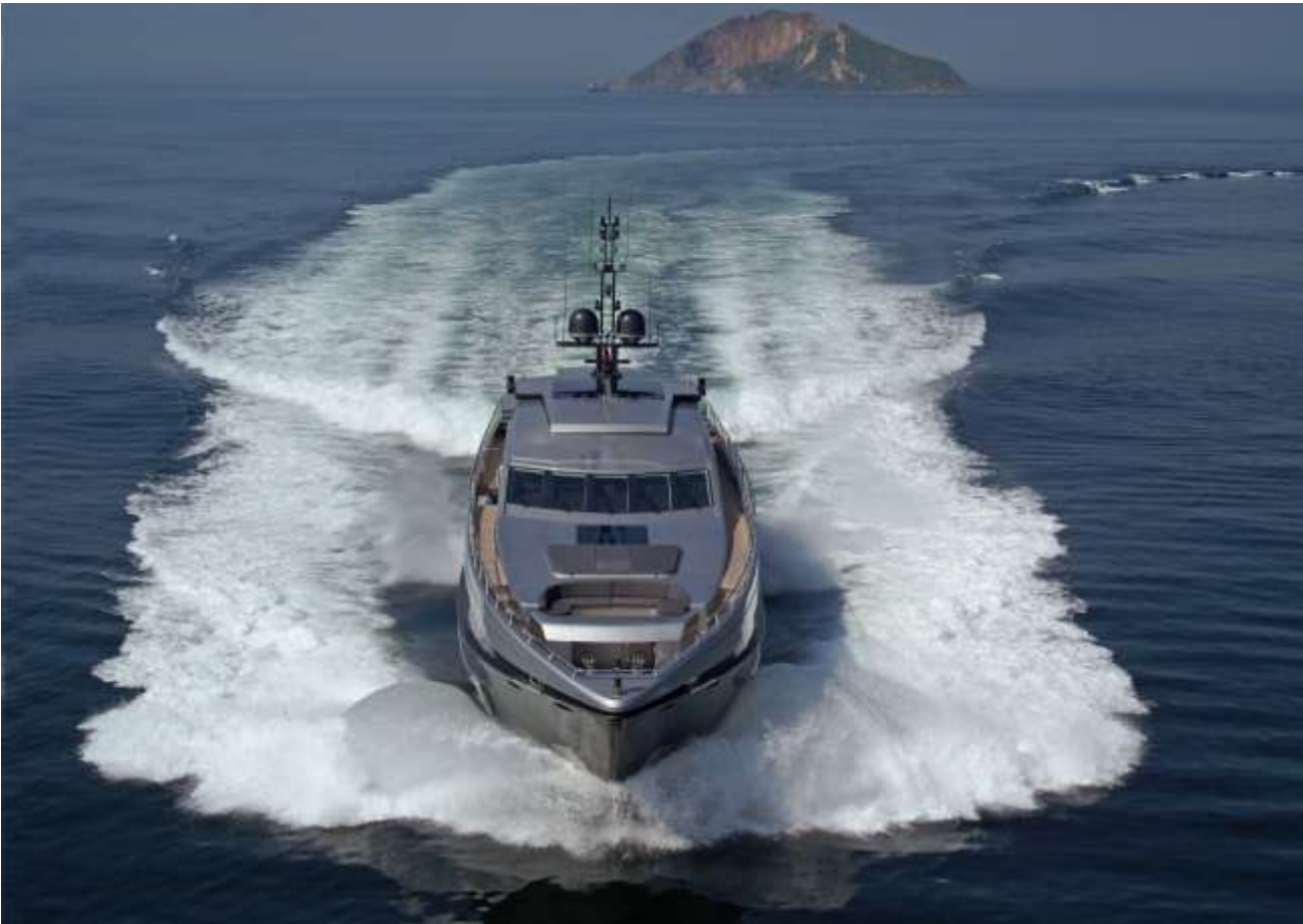
Sleek, stylish and sexy.