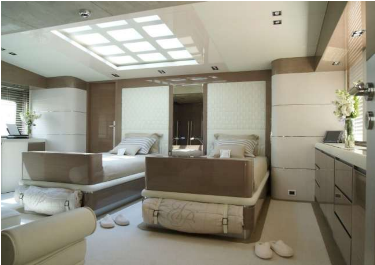
Main Deck Master Stateroom Twin beds each with pop up TV in footboard.