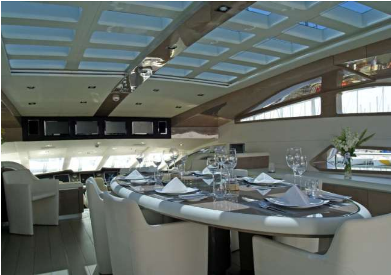
Upper Deck Dining Salon Features 4 TVs with multiple servers.