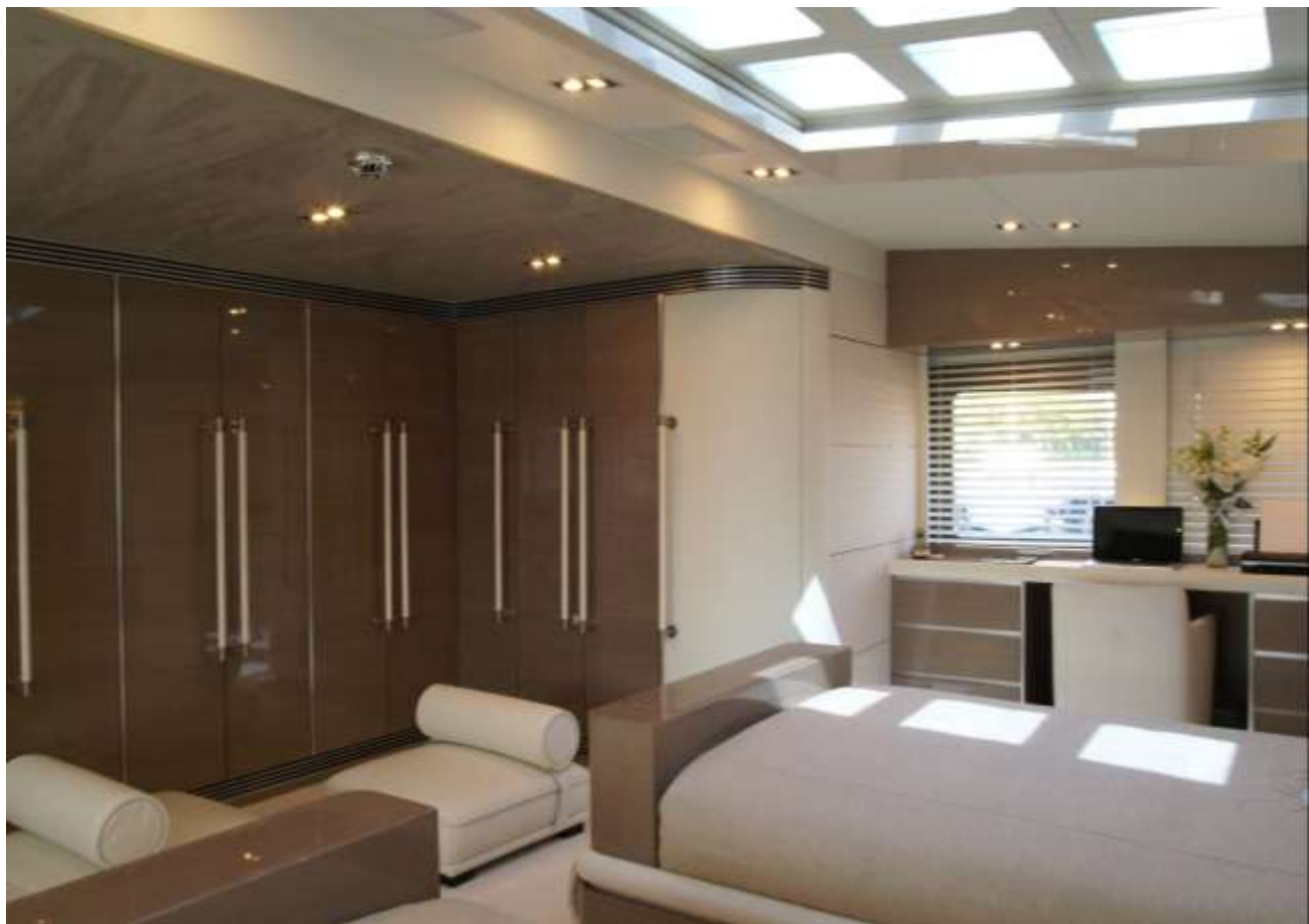
Main Deck Master Stateroom Modern design with skylight ceiling.

BUILDER..... BILGIN BUILT ..... 2010 LENGTH, FEET/METERS ..... 123'/ 37.5M CABINS ..... 4 GUESTS ..... 8 CREW ..... 6 CRUISING SPEED ..... 16 knots