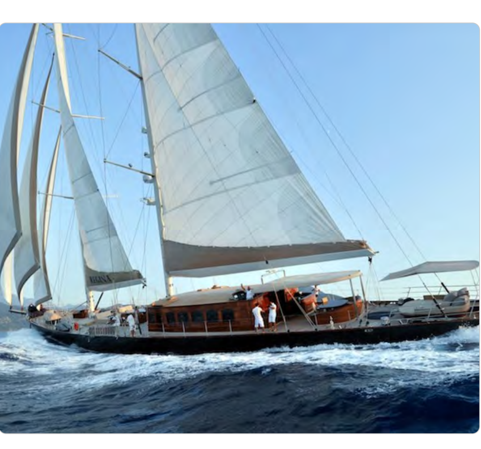
S/Y REGINA 56 m