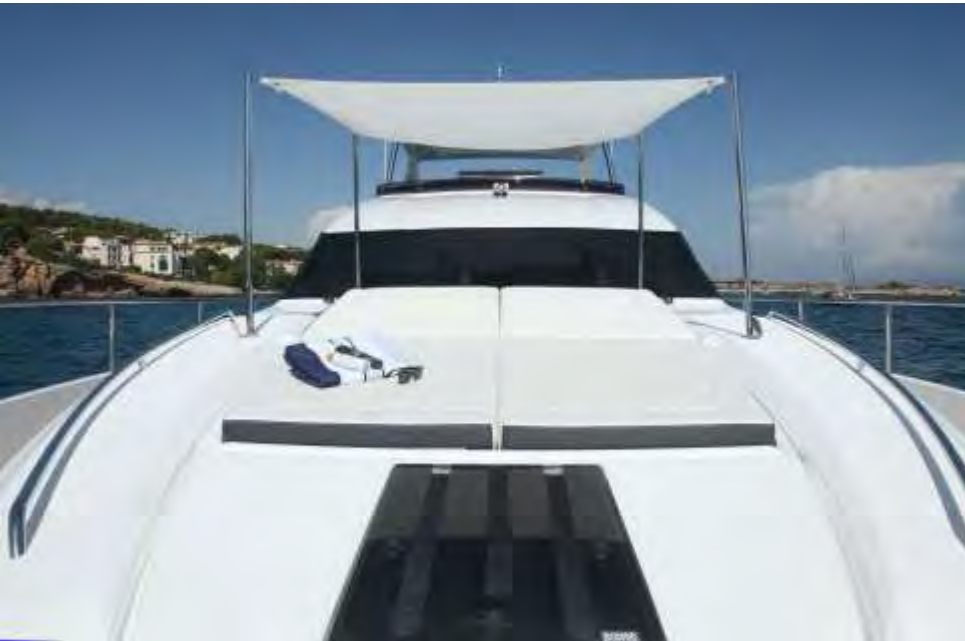
Forward sunbathing area