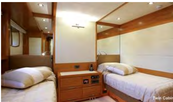
Twin guest cabin