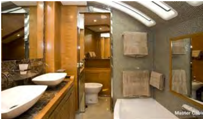
Owner's cabin, bathroom