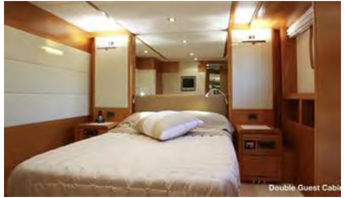
Double guest cabin