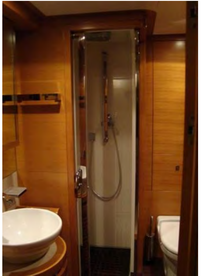
Guest bathroom detail II