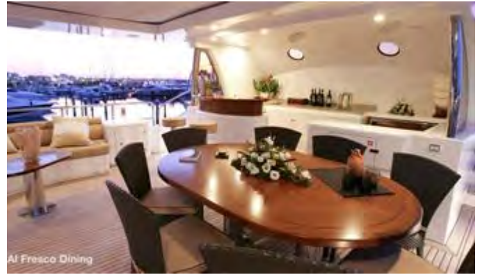
Al fresco dining