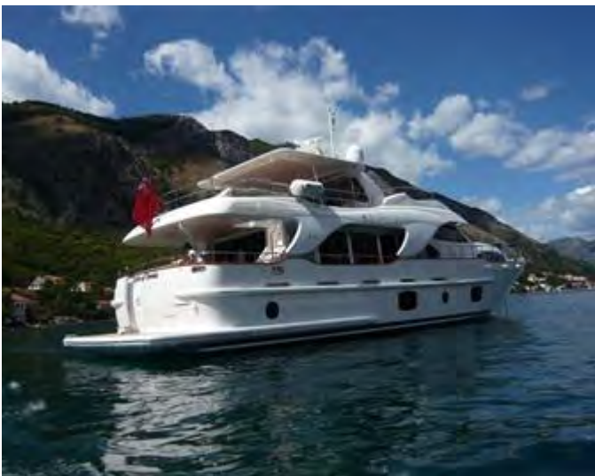
At anchor in Croatia III