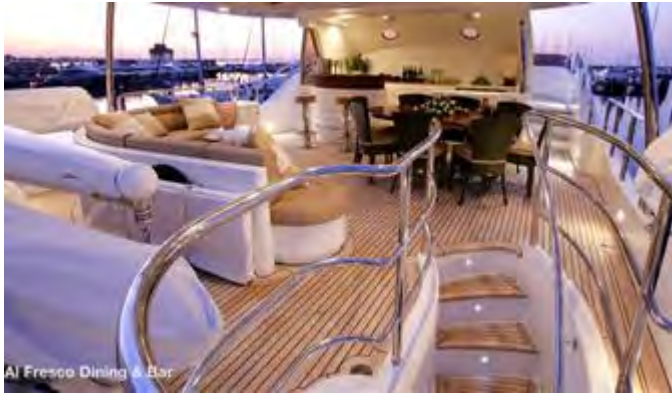
Al fresco dining & bar