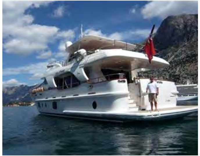
At anchor in Croatia II