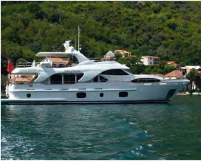
At anchor in Croatia