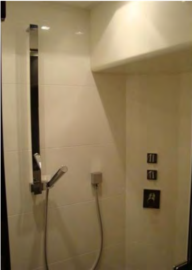
Guest bathroom detail I