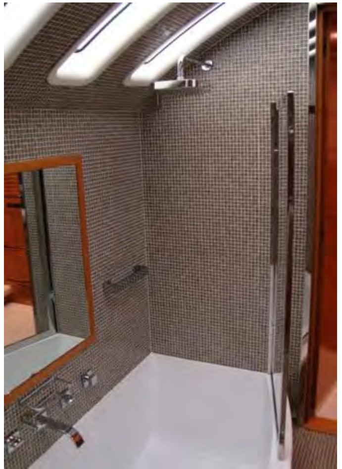
Owner's bathroom, bath tub with shower