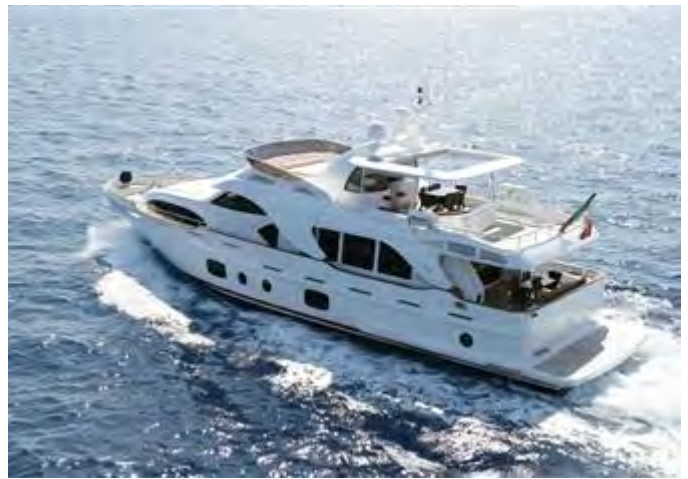
Cruising II (sistership)