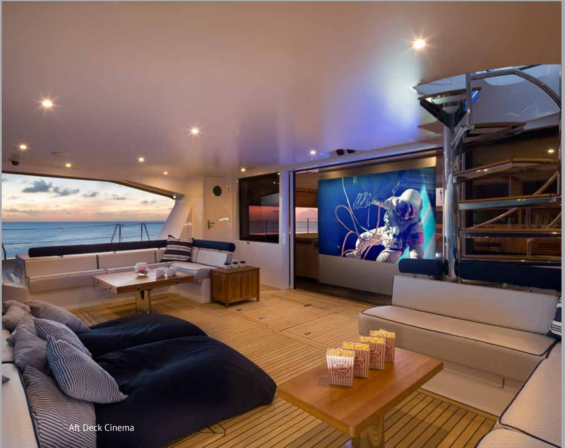
Aft Deck Cinema