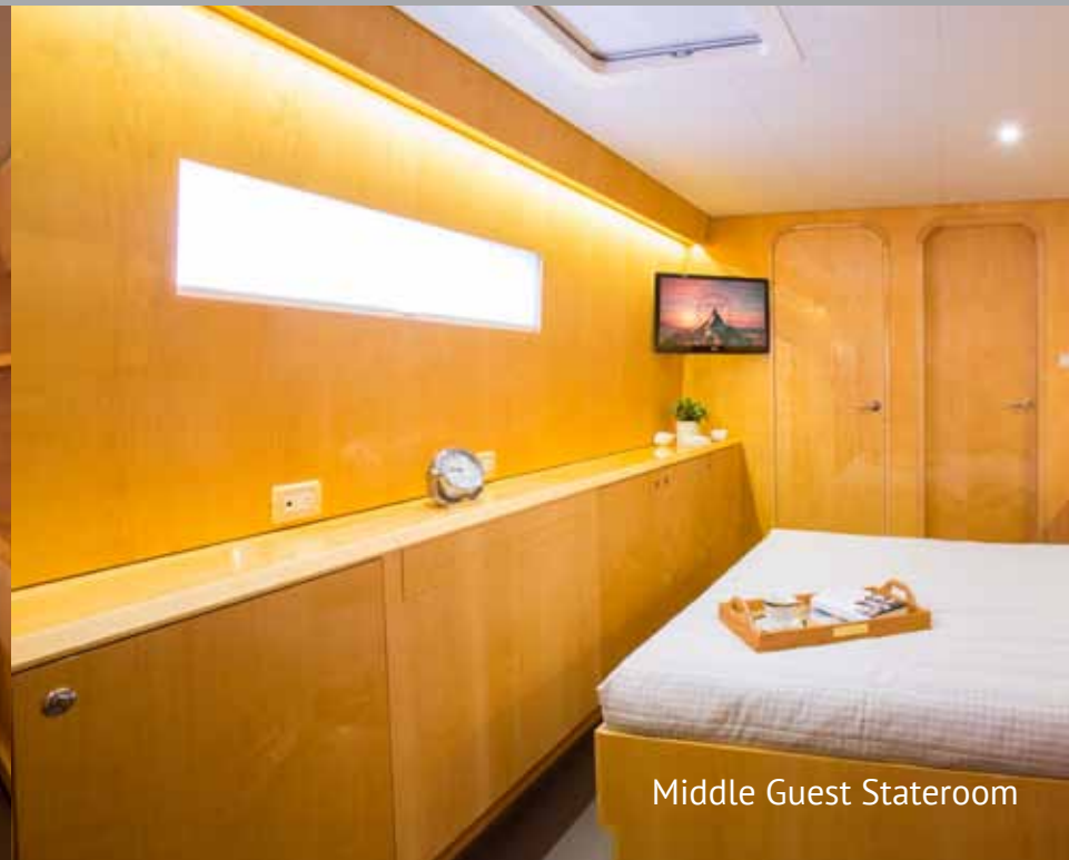
Middle Guest Stateroom