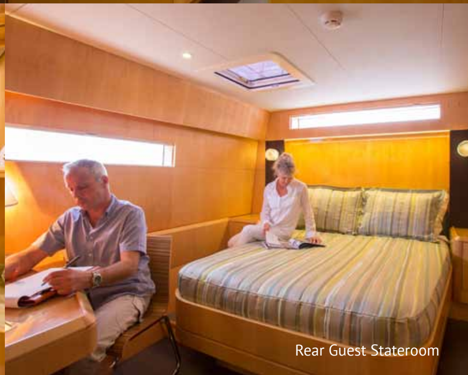
Rear Guest Stateroom