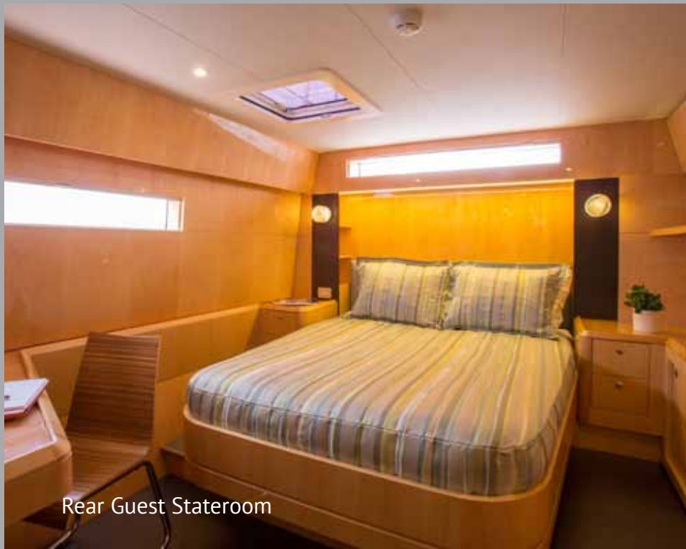
Rear Guest Stateroom